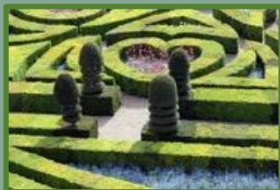
Garden of Love at Chateau de Villandry, Villandry, France