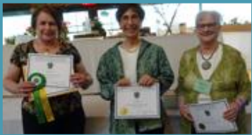
Just a few of the members who received GCFP awards.