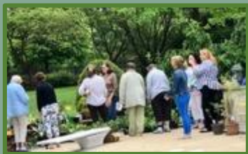
NGC members surveying the plants offered for exchange prior to making their selection.