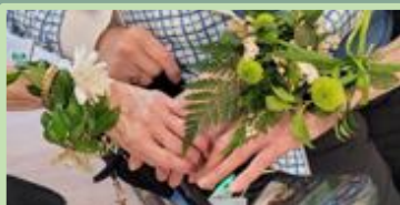
Providence Place residents wearing the wrist corsages prepared with NGC members.