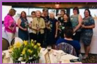
Welcome new NGC members!