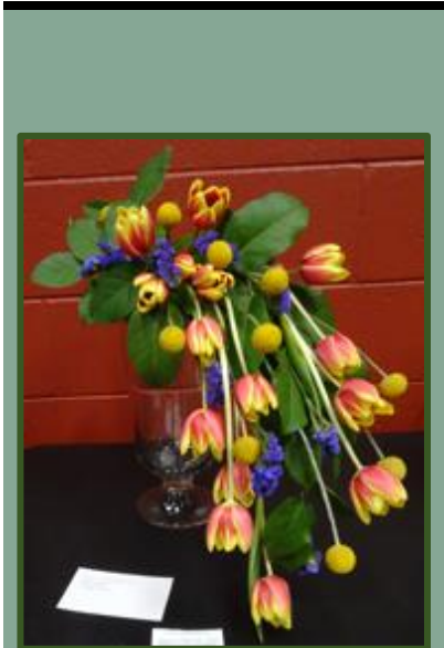
Blue ribbon winning cascade design.

Horticulture was not judged, per the Yearbook, but members were wowed by the beauty and variety of the glorious spring exhibits! Pictures are courtesy of A. Lehman.