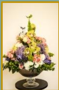
A traditional mass design is a design using plant material in a closed silhouette, with a fully developed focal area, yet defined linear pattern. The design is primarily symmetrical in the form of a sphere, oval, or pyramid. Picture from Beverley Hills Garden Club.