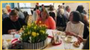
NGC members enjoying their lunch!