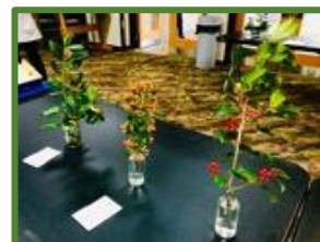
Selected show of the month entries.