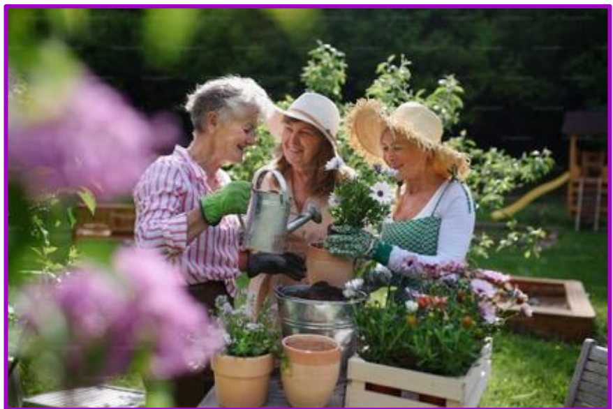
Gardening Friends.