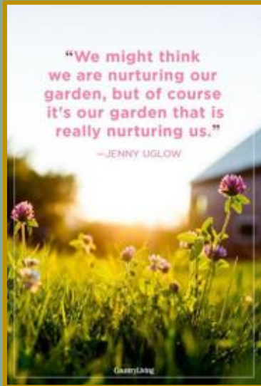
Cover picture from Country Living .

Portia Potts submitted the following quote to the Clippings and commented that it reminded her of garden club members. Thank you, Portia!