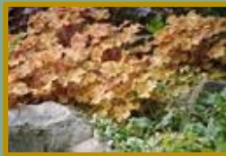
Heuchera 'Caramel' (Coral Bells).