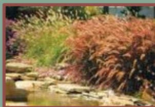
Ornamental grasses from your garden can be used to make a beautiful fall arrangement.