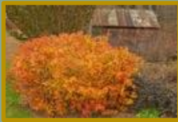
Fothergilla in Fall.