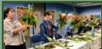
Workshop attendees preparing their fall grass floral arrangements.