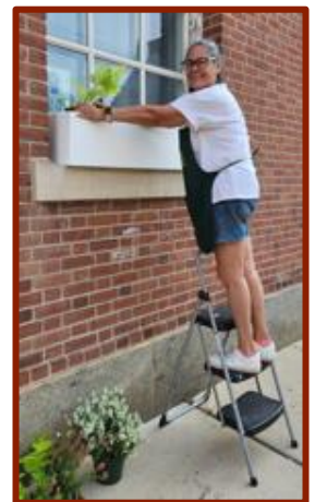
Norristown Beautification Committee members work to decorate the façade of the Theatre Horizon.