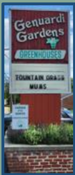
In September, a private home on Swede Street and Genuardi Gardens and Greenhouses received NBC's Garden of the Month recognition.