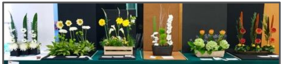
Entries for the novice class demonstrating a parallel design.