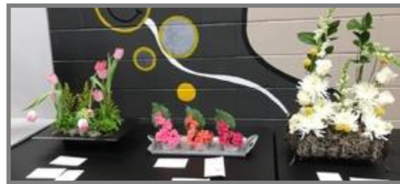
Several of the design entries from the May Show of the Month.