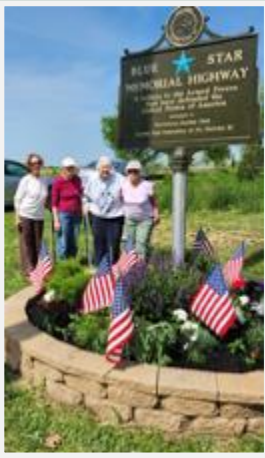
NGC members beautify the Blue Star Memorial in May.