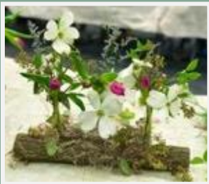
Sue Harbaugh's lovely parallel floral design using the test tube log as a vase and members having fun at the workshop (below).