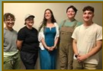
Scholarship winners present at the June meeting.

NGC and Novelli Scholarship Fund Winners: