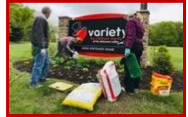
Some of the NGC members that helped with the planting at the Variety Club.